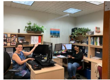
Hanging Vinyl Shields