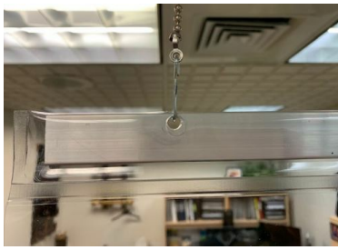
Hanging Vinyl Shields