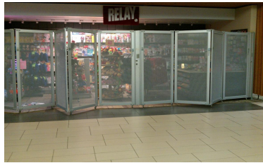
Roll and Fold Partitions