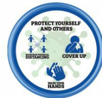
12" Window Cling