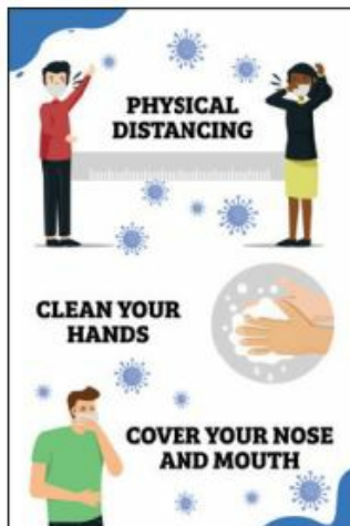
12" x 18" Wall Graphic