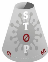
Stool & Bench Seat Sign